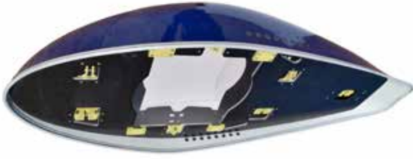
Radome & Mounting Adapter Plate